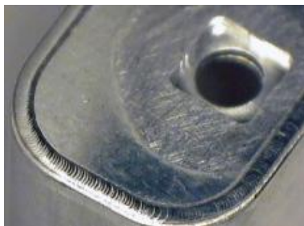
Seam weld example