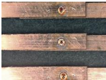
Spot weld example