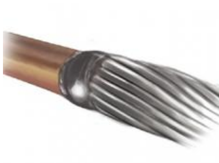
Wire to component pin