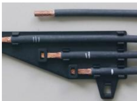
Resistance Weld Cables Car Heating