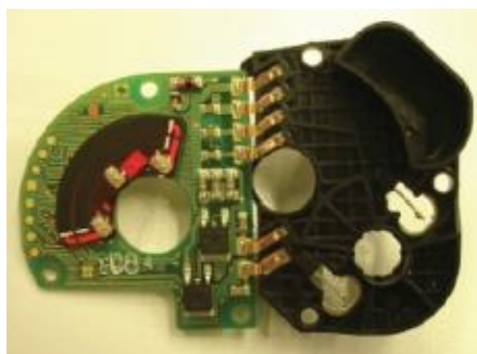
Resistance Weld Engine Component