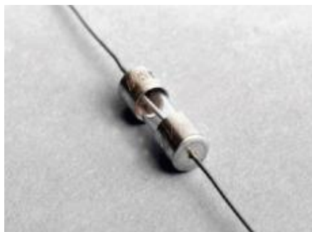
Gap welding of coin cell tabs