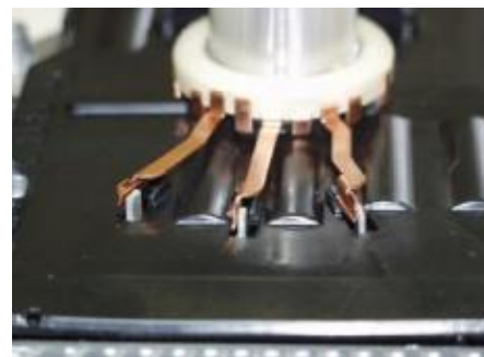
Projection Weld Radiator Connector